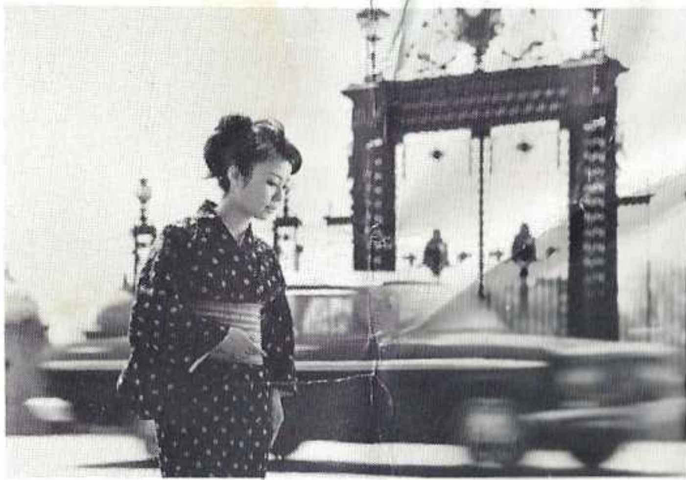
Prime lens 55mm